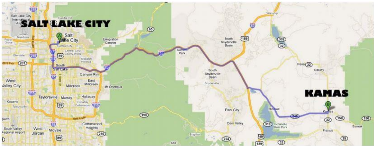
(Salt Lake City to Kamas Utah Map)

Take I-80 E out of Salt Lake City. Take exit 146 for US-40 E toward Heber/Vernal. Take exit 4 toward Park City/Kamas. Turn left at UT-248 E/Old Hwy 40. Continue to follow UT-248 E into town, the Kamas Food Town is on the left side of the road as you enter town.